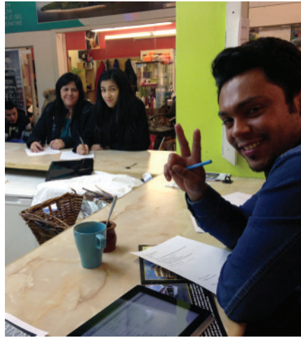
Images from the co-creation and community engagement activities.