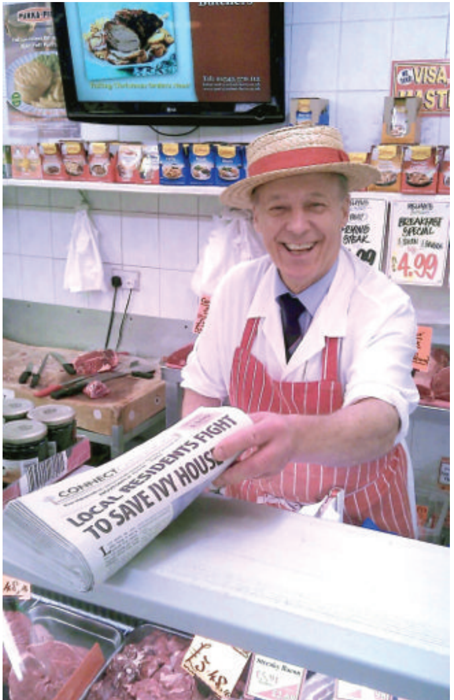
Distribution of the newspapers by different members of the community helped to increase the area the papers reached.