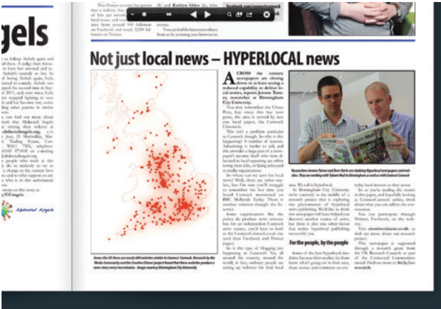
A screen grab of the newspaper, available to view online. (August, 2014).